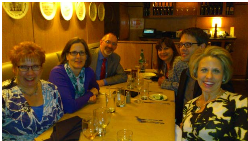
Legal Industry Council Dinner