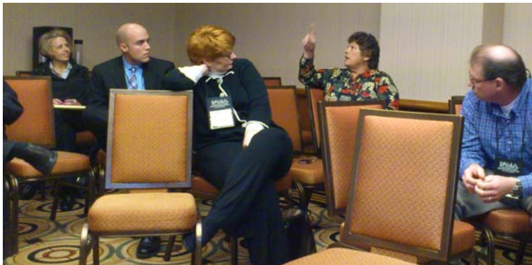
Legal Industry Hot Topics Roundtable

If you’re able to, please consider joining the Legal Council from October 31 – Nov 2 for World Workplace. We will be holding our annual meeting on-site there, as well as planning a group dinner. It’s a great way to make connections and get the most of your IFMA LIC membership!