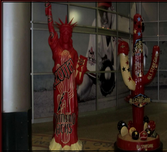
World Workplace 2011 Welcome Reception at Chase Field.